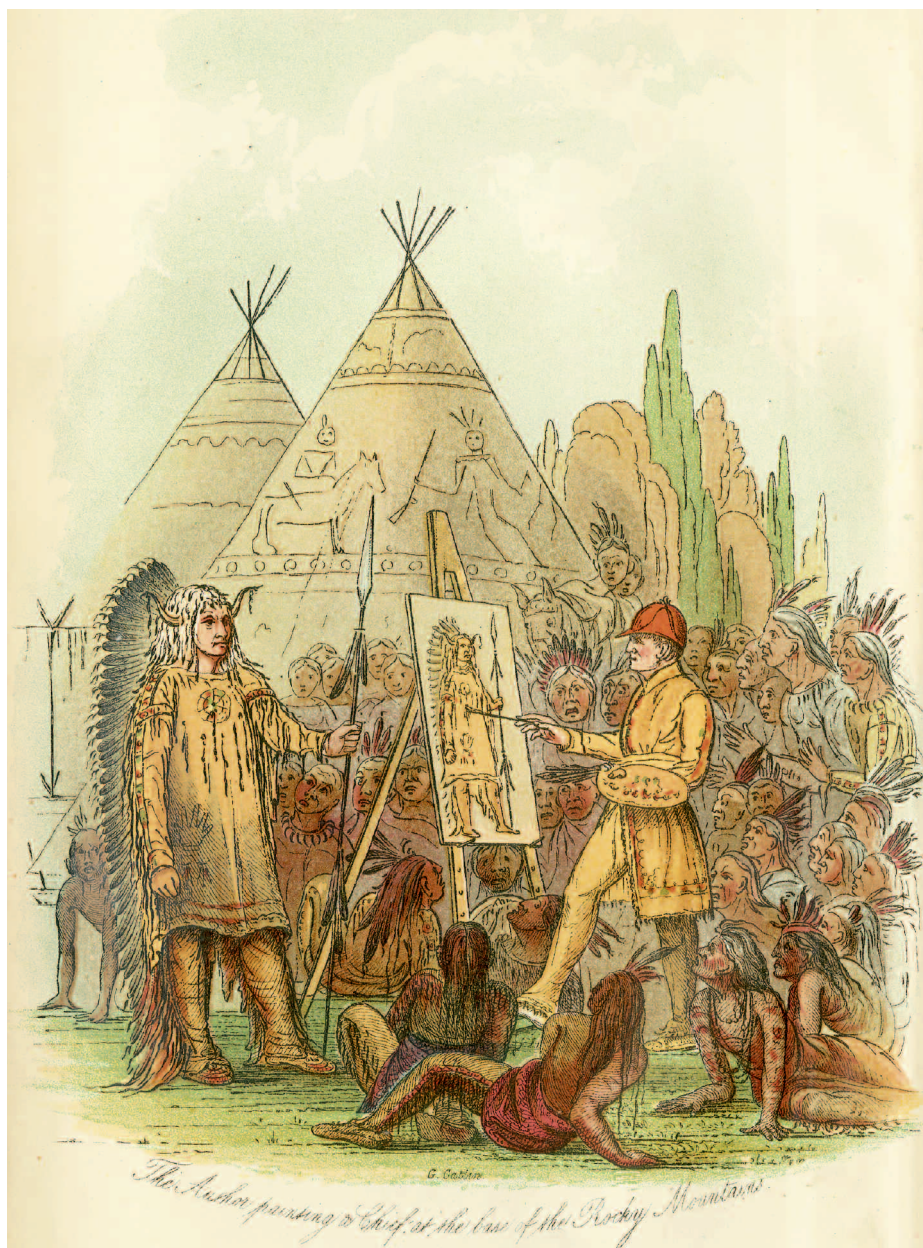
ONE OF THE 360 ENGRAVINGS AFTER PAINTINGS BY GEORGE CATLIN (1796-1872) INSIDE HIS ILLUSTRATIONS OF THE MANNERS, CUSTOMS & CONDITION OF THE NORTH AMERICAN INDIANS (1842) SCR N200 C28 A2